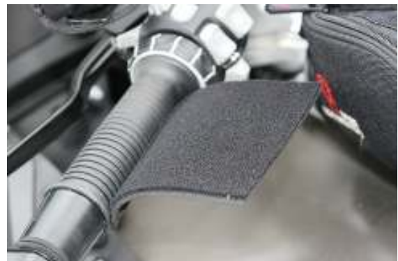
PHOTO 1 The proper alignment of new neoprene grip installed on stock grip.

Caution: Do Not Overlap this Metal Bar-End of your Handlebar With Your New Neoprene Grips!!